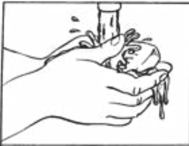
1. Wet hands with soap and warm water.