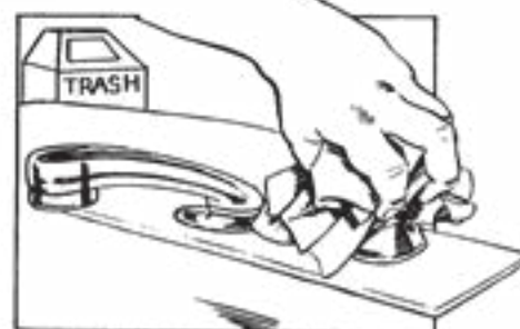
5. Turn off water with paper towel. Throw towel away.